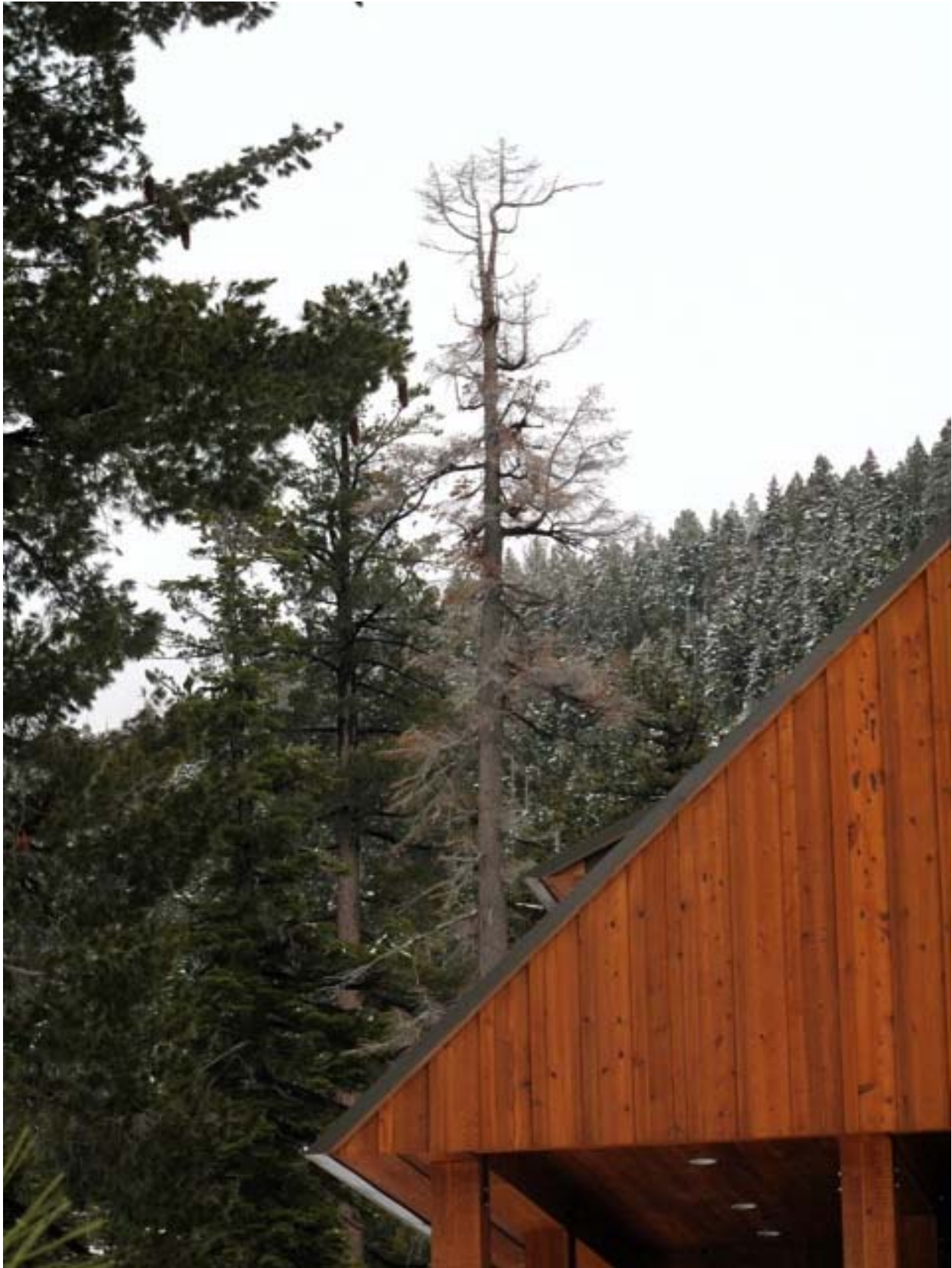
Tree #1 The New Store is in the foreground. Angora Ridge is in the background. Per the “map”, this is Tree #1