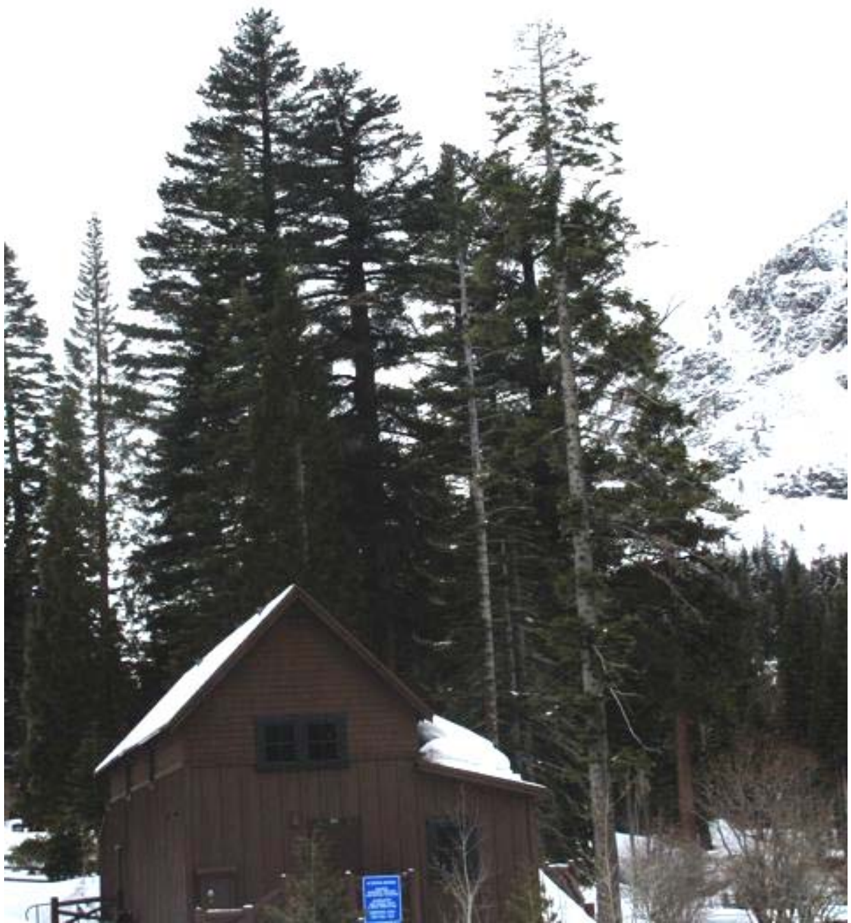
Tree #2 The Old Store is in the foreground. So, this is Tree #2 per the “map” on page 3.